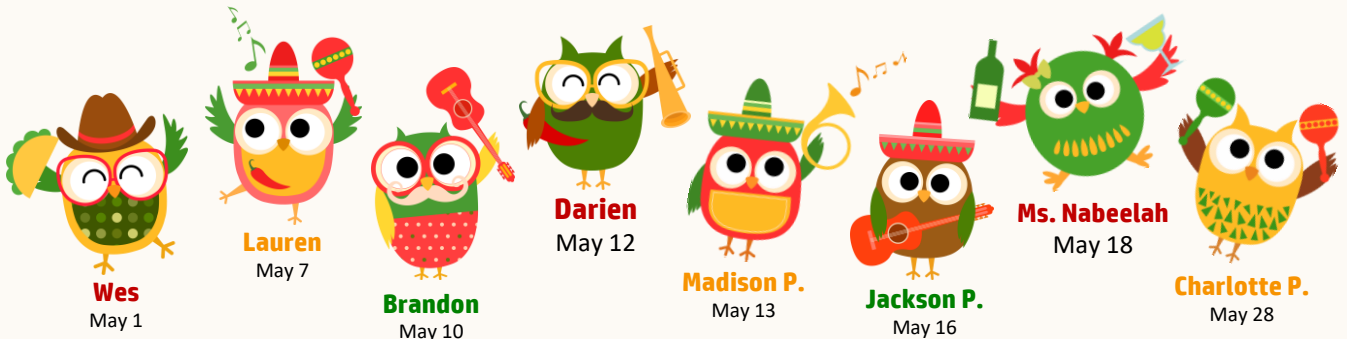
Wes May 1